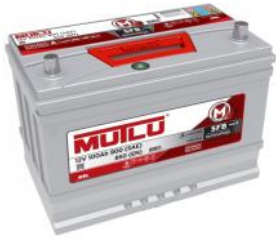
BATTERY 17 PLATE (LH) 800 CCA 100AH N70