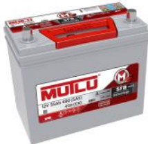
13 PLATE 55AH MUTLU HP 480CCA BATTERY