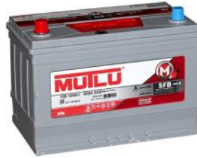
BATTERY 17 PLATE (RH) 800 CCA 100AH N70