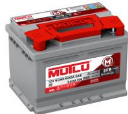
AUTO BATTERY 540CCA DIN 45 HT LB2 60AH